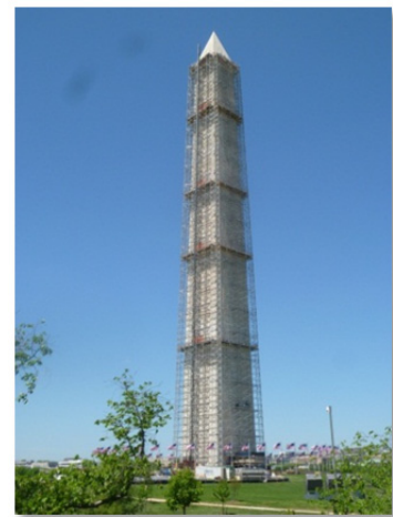
May 2, 2013