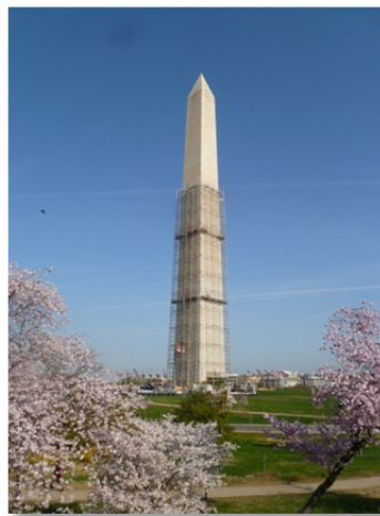
April 9, 2013